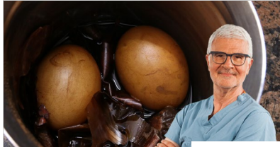
U.S. Surgeon: Th Trick Empties Alr Immediately Your Every Morning