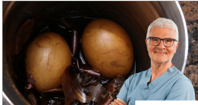
U.S. Surgeon: Th Trick Empties Air Immediately Your Every Morning