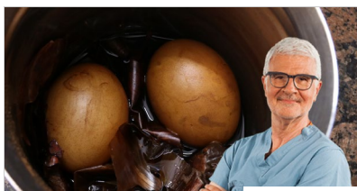
U.S. Surgeon: Th Trick Empties Alr Immediately Your Every Morning

The lawsuit says the officer and his informant framed at least 16 people for dealing drugs: 15 for heroin and one for marijuana. It's unclear what happened with a few of them, who aren't part of the lawsuit.