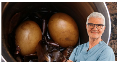
U.S. Surgeon: Th Trick Empties Alr Immediately Your Every Morning